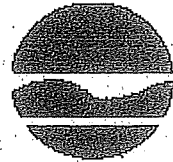
Joe Martens Commissioner

New York State Department of Environmental Conservation Division of Water Bureau of Water Permits, 4th Floor 625 Broadway, Albany, New York 12233-3505 Phone: (518) 402-8111 • Fax: (518) 402-9029 Website: www.dec.ny.gov